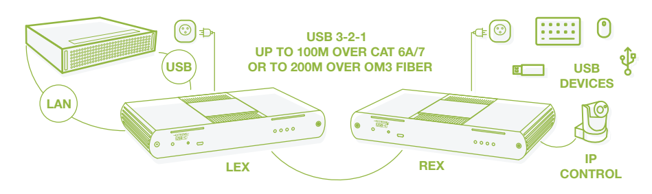
OPTIONAL NETWORK CONNECTION

For enhanced experiences, including higher resolution and support for ISO transport devices and modes, the Raven 3104 Pro is recommended. Raven has been successfully tested with many major USB 3.1 conference cameras in conjunction with web conferencing applications such as BlueJeans, Cisco WebEx, Google Hangouts, Skype for Business, Microsoft Teams, and Zoom.