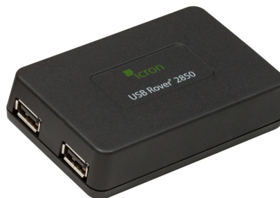
REX (Remote Extender)