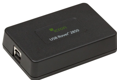
LEX (Local Extender)

The USB 1.1 Rover 2850 extends USB 1.1 connections beyond the desktop up to 85* meters.