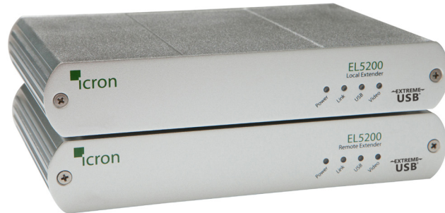
LEX (Local Extender)

The EL5200 extends both HDMI and USB 2.0 up to 100m using a single Cat 5e* cable.