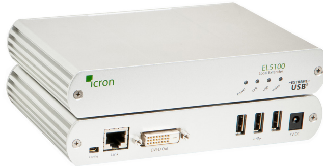
LEX (Local Extender)

The EL5100 extends both DVI and USB 2.0 up to 100m using a single Cat 5e* cable.